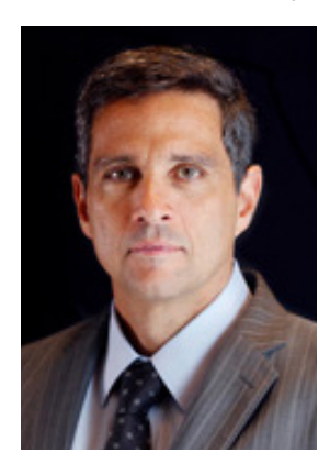
Campos Neto