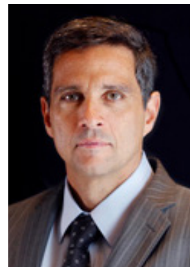
Campos Neto